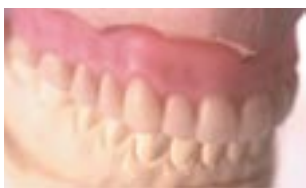
Diagnostic waxing to determine tooth position