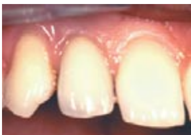
Single tooth implant in centre of picture