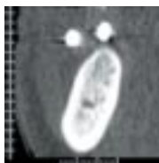
Selection of images from CT scans of the upper and lower jaw