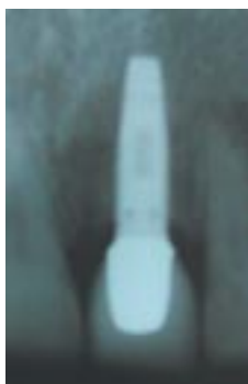
Single tooth implant alongside natural teeth